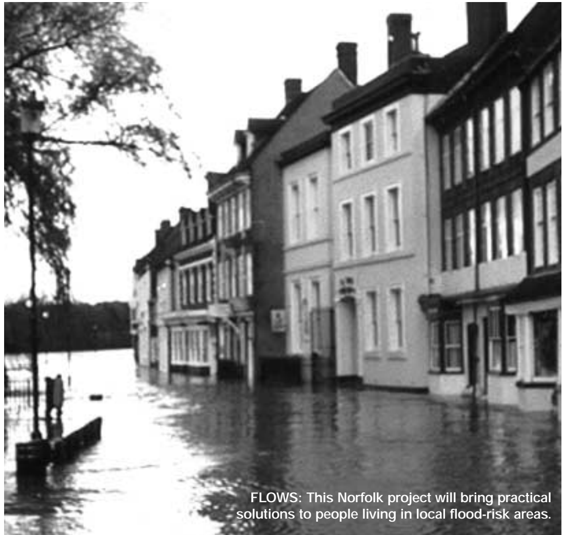
FLAWS: This Norfolk project will bring practical solutions to people living in local flood-risk areas.

and we recently sponsored the first National Flood Forum conference in York.